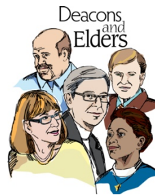
Welcome to new Deacons and Elders